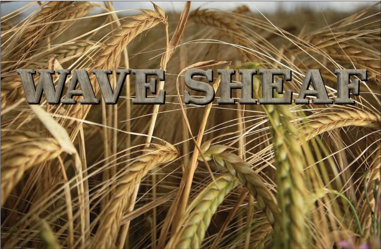
THE FIRST-FRUITs of the grain harvest were brought to the priest to be waved before God at the beginning of the seven weeks of harvesting. The wave-sheaf—the “first of the first-fruits”—pictures Jesus Christ.

Submissions may be sent to vancestinson@cgi.org