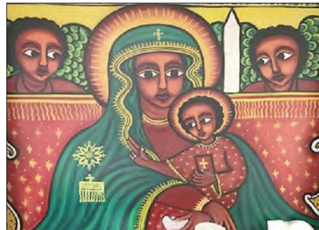
Joseph, Mary, Jesus, and the first-century disciples are depicted as black in the iconography of the Ethiopian Orthodox Church. This is not surprising. Christian artists tend to give biblical characters features that resemble their own.

Revelation 1:12–15 is a vision and is filled with symbolism . The “loud voice” symbolizes power and the importance and certainty of the things revealed through the Source of the voice. The white hair symbolizes wisdom, dignity, and honor. His brightly shining face symbolizes His glory and deity. His flaming eyes and the sword from His mouth show Him as judge, ruler, and conqueror. No part of this