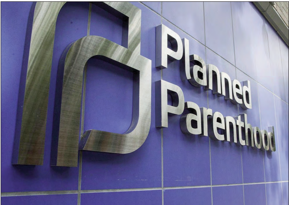
A recent Planned Parenthood report reveals that PP affiliates performed 345,672 abortions from October 1, 2017, to September 30, 2018.

Don’t get me wrong, lives are definitely in need of and worth saving. My point here is that all lives are precious, all lives matter, and all lives are worth saving! The progressive force trying to control the world likes to pick and choose and create rules and ethics based on their own beliefs and struggle for power which disregard any opposing views—one of which is often the belief in God, unfor-