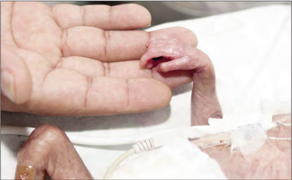
HUMAN LIFE MATTERS! This tiny human being, born prematurely, deserves a chance at life.

DEADLINE FOR NEXT ISSUE: November 16, 2020 Submissions may be sent to vancestinson@cgi.org