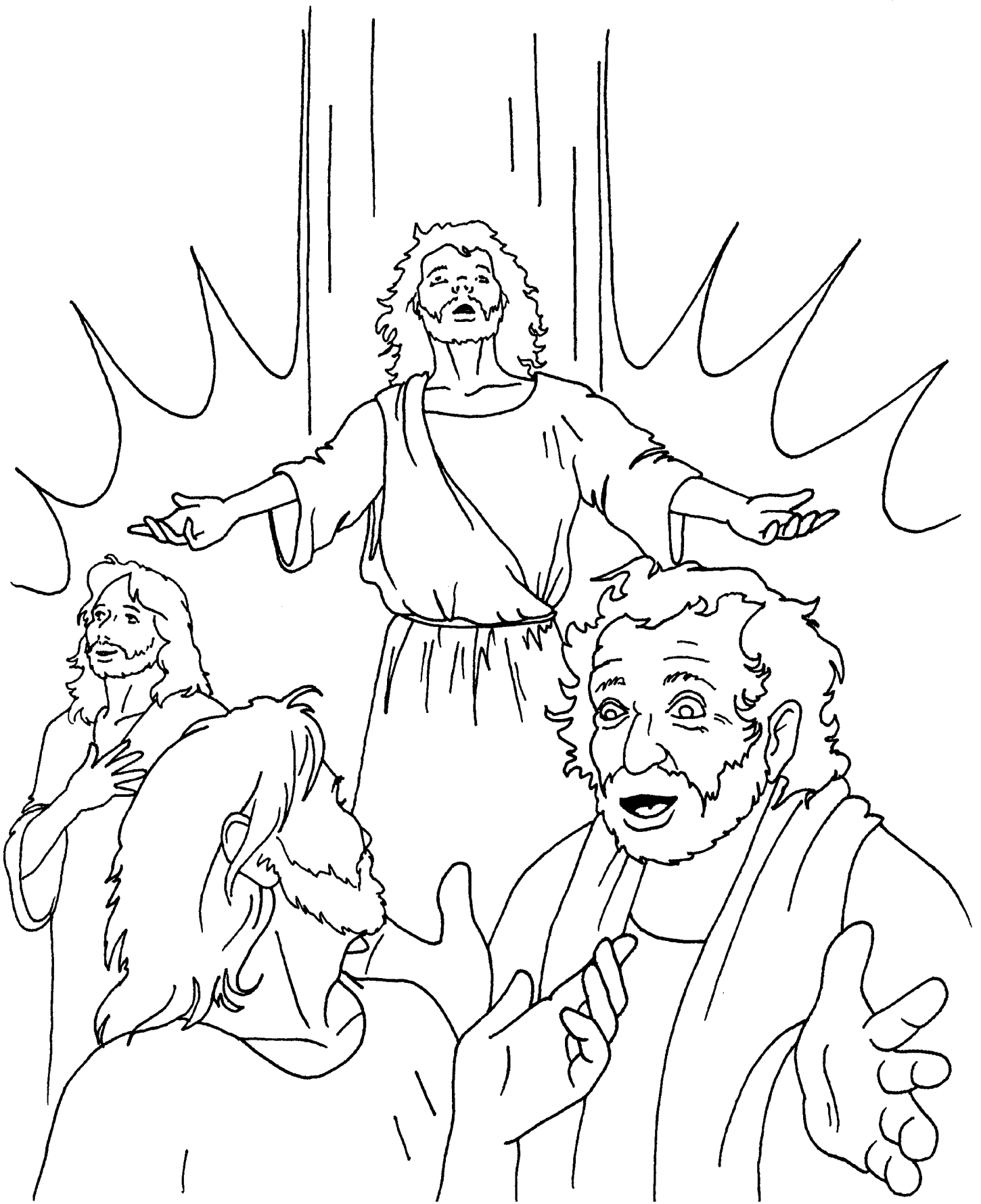
"On the Day of Pentecost the disciples are filled with the Holy Spirit" Acts 2:1 – 41