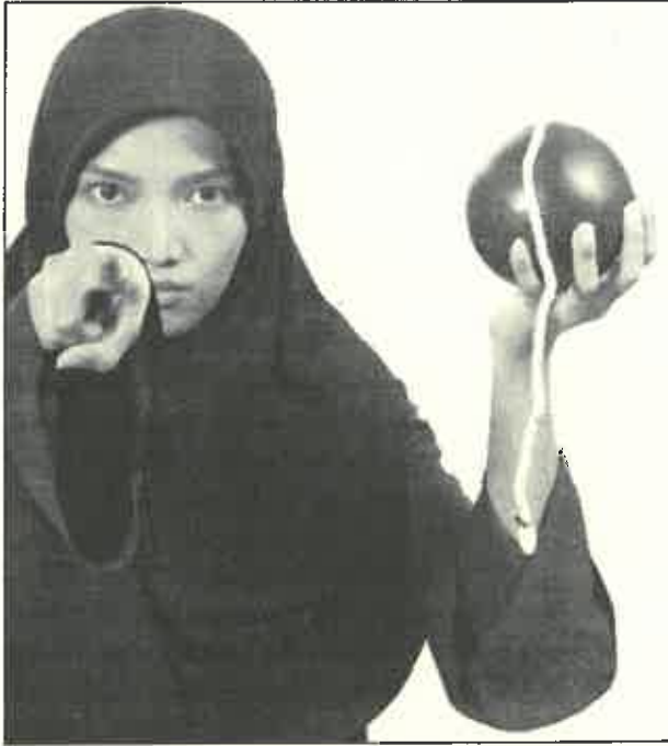
Terrorist woman with bomb

trol within the government. And Iran remains defiant and relentless in its pursuit of a nuclear bomb, and appears to be closing in on accomplishing that goal, while the United States looks on, lacking a substantive strategy to stop them from doing this.