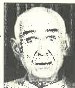
Marshall Applewhite, Jr.

Or the case of Marshall Applewhite, Jr. , of the Heaven's Gate group, who led 38 of his followers to wear purple clothing and eat the poisoned purple pudding of death!