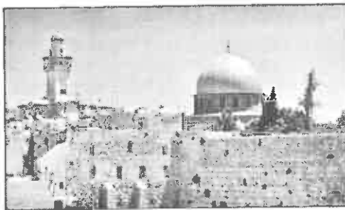
Dome of the Rock

assumed control of the remains of the Byzantine Empire (Eastern Roman Empire) as Emperor Alexius I. It was at the Council of Clermont, November 1095 C.E., that Pope Urban called upon Western Christians to help the Byzantines reconquer the Holy Land from Islamic dominance. It was met with a great outpouring of support from all classes of the population who were willing to go and fight the Muslims with and for the sign of the cross.