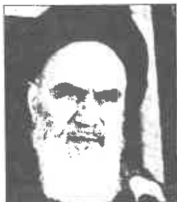
Ayatollah Ruhallah Khomeini

and clear statement? What is it we don't understand?