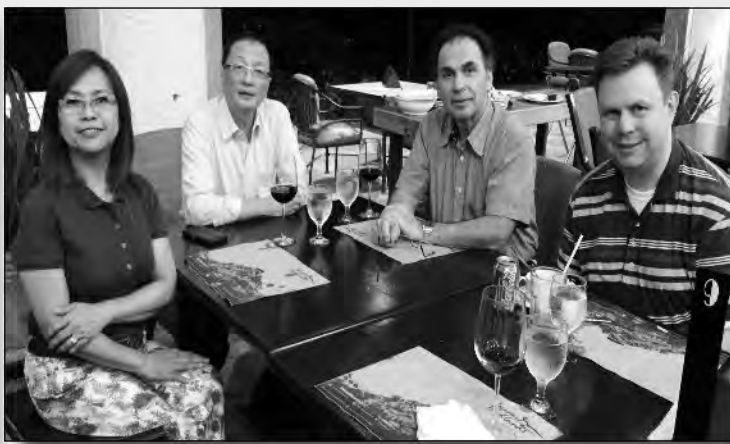
Dinner with the Co's