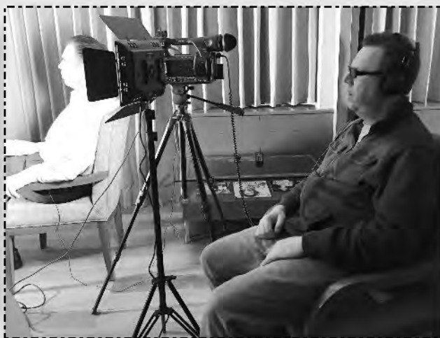
Jeff behind the camera