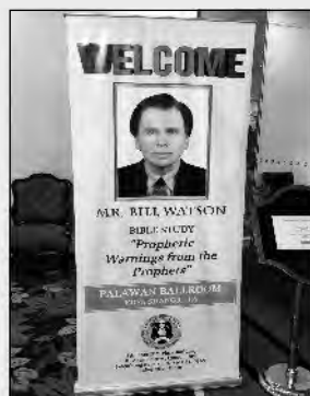
Advertising banner for the Manila Campaign at the hotel