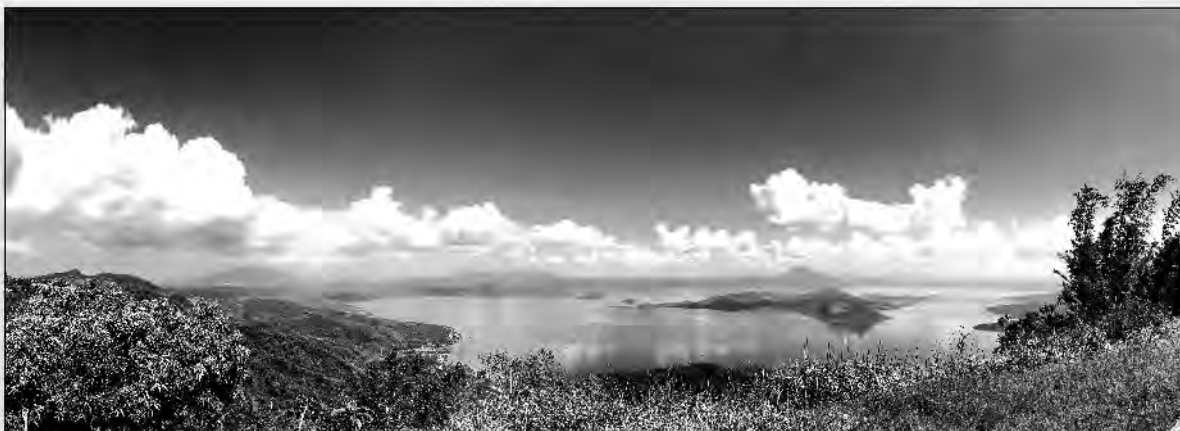
The landscape of the Feast site at Tagaytay