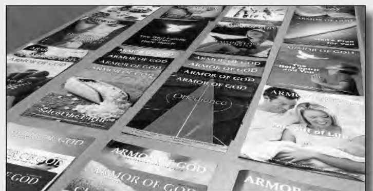
Literature displayed at the Philippines CGI home office