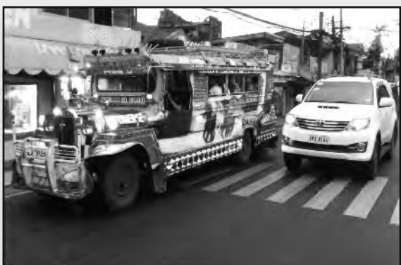
A “Wiley” (modified Jeep used for public transportation)