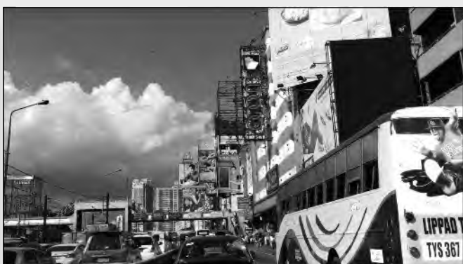
Typical city traffic