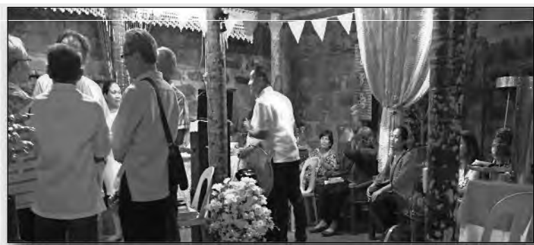
More members at the Luntok party after the Naga City Campaign