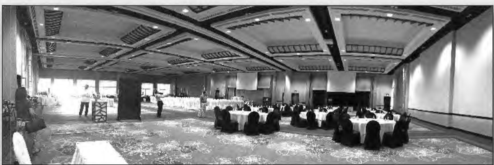
Tagaytay Feast Site Meeting Room