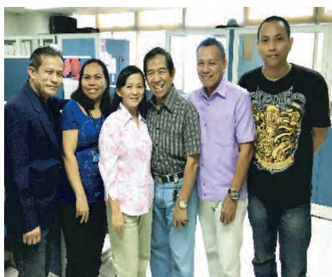
Home Office Employees

The first day was filled with visiting the home office, located in the IBM Plaza, Eastwood City Cyberpark, Bagumbayan, Quezon City, up on the 8th floor. Here in this office of about 2,000 square