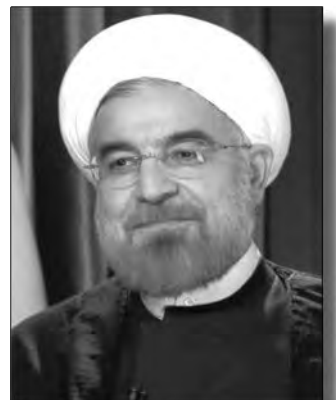
President of Iran Hassan Rouhani