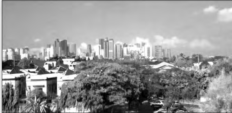
Cityscape of the greater Manila area