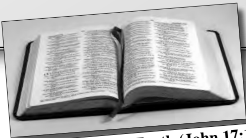
Thy Word is Truth (John 17:17)