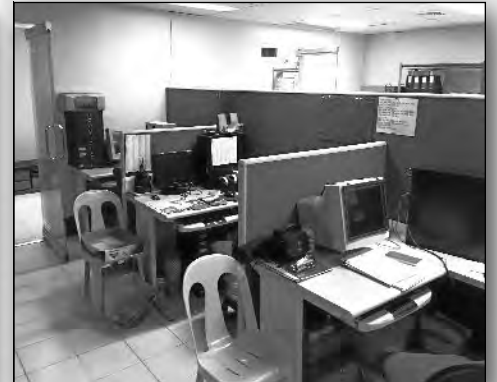
Cubicles at the CGI home office