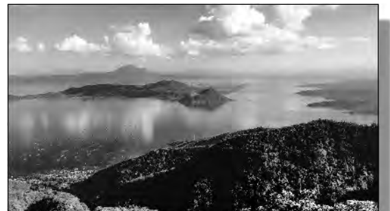
The crater within a crater at Tagaytay

Upon arriving at Tagaytay, Elder Co's wife, Menchu, joined the group. Together they toured this Feast site, located about 50 miles outside of Manila, in the country. It is located on the cone of a volcano—a beautiful area surrounded by mountains, grass-covered rolling hills, and a wonderful facility to meet in with plenty of restaurants and shops in the area. The highlight of this location is the lake that is inside the cone. Much like Crater Lake in Oregon, USA, this crater has a lake inside of it too, but about 10 times the size. It's Crater Lake on steroids! Gorgeous! There are many water sports and functions available for your full enjoyment on the water. It really is a well-suited location for the Feast, and has to be one of the most beautiful Feast sites one could attend.