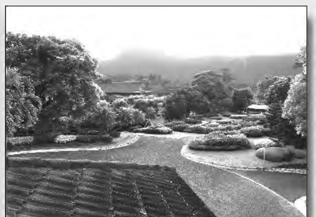
The gardens of Tagaytay