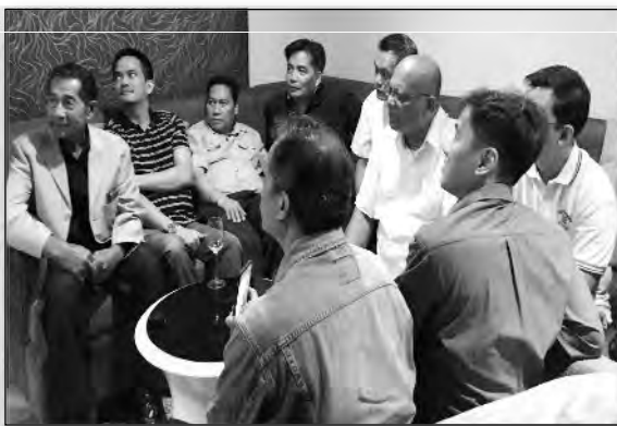
Leaders from the greater Manila area