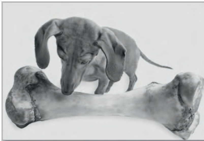
Is Bigger Really Better?

Christ discussed the preoccupation of such concerns among other life stressors when He spoke to the church and all congregations that compose the body of Christ—all the while acknowledging their size in the greater scheme of things. "Fear not, little flock; for it is your Father's good pleasure to give you the kingdom. Sell that ye have, and give alms; provide yourselves bags which wax not old, a treasure in the heavens that faileth not, where no thief approacheth, neither moth corrupteth. For where your treasure is, there will your heart be also" (Luke 12:32–34, KJV). Focusing on spiritual attainments is always the priority above physical conveniences and promotional ambitions. We must put those aspects into perspective when evaluating our outlook. Whether the congregations that we attend are large or small is inconsequential. It is the purpose of this modality—the spiritual organism that we call the church, to foster an environment where parishioners can be edified and develop the character of God. The quantitative frame within which this process is carried out is secondary. Yet the fundamental ambition of spiritual growth should remain our primary pursuit. Ω