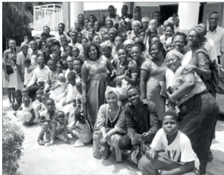
Feast Attendees on the Last Great Day