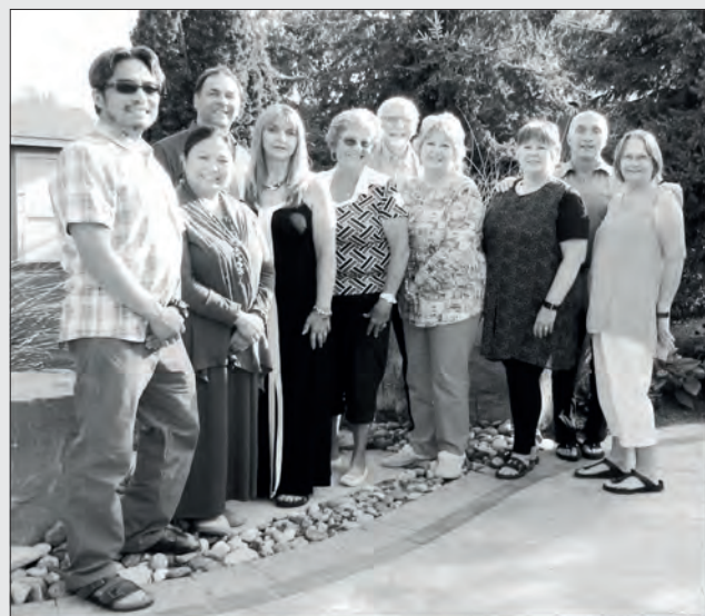
Founding members of the Kawartha Lakes congregation, plus guests, pose after Sabbath services