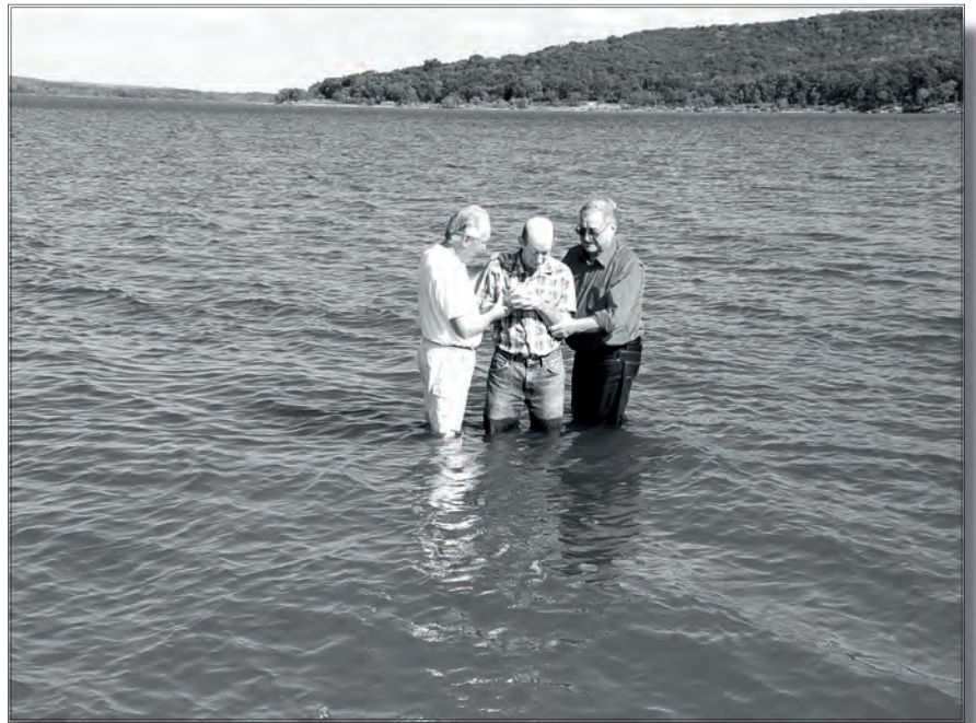
Baptism at Wagoner Feast site