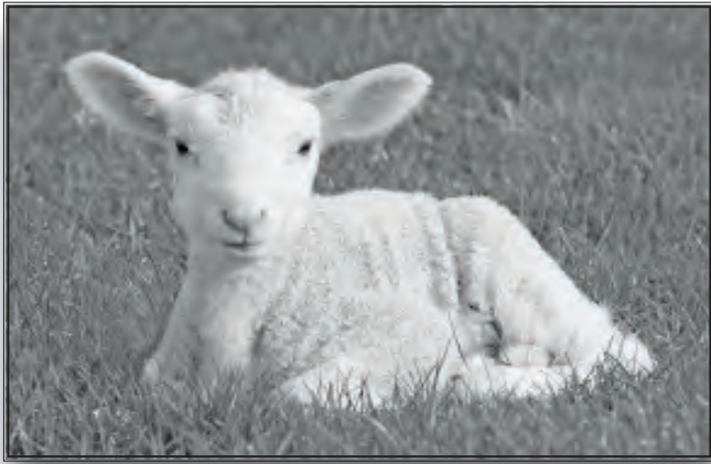
Our true Passover Lamb (1 Corinthians 5:7)

to say we love and believe the truth, but we must love by doing (1 John 3:17–18). The hearers are not justified. Acting on what we know, or living our faith is key to justification and pleasing the true God (James 2:15–