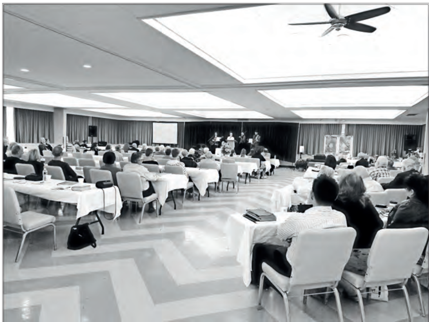
Special music at Wagoner Feast site