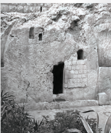
Was this Christ’s tomb?

Once you understand the Three Days and Three Nights , you will see that there is absolutely no credibility for the Easter tradition or Sunday worship.