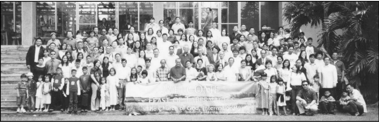
More than 180 people from different parts of the Philippines attended the feast in Tagaytay City.