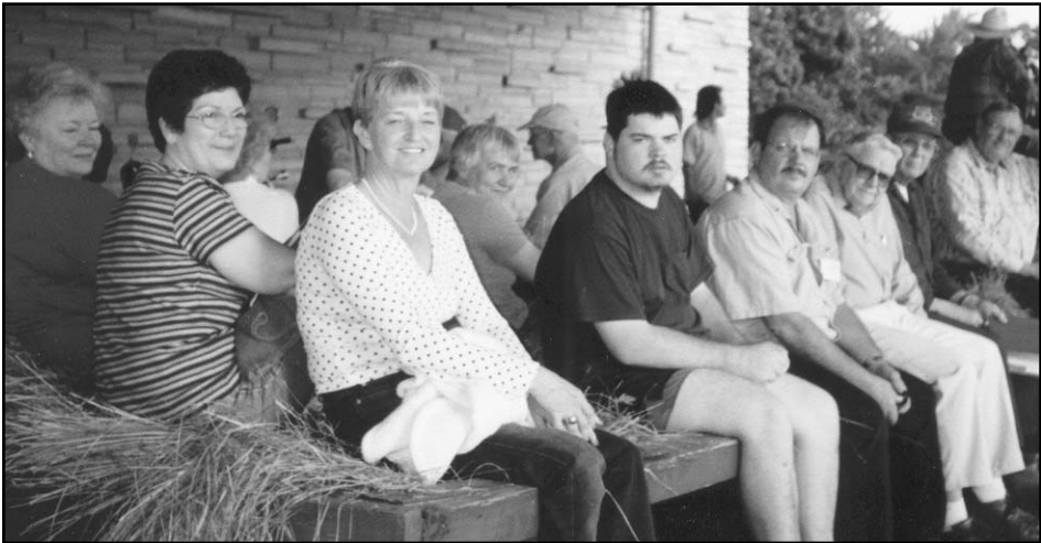
Below: Brethren enjoy a hay ride at the Oklahoma festival site.