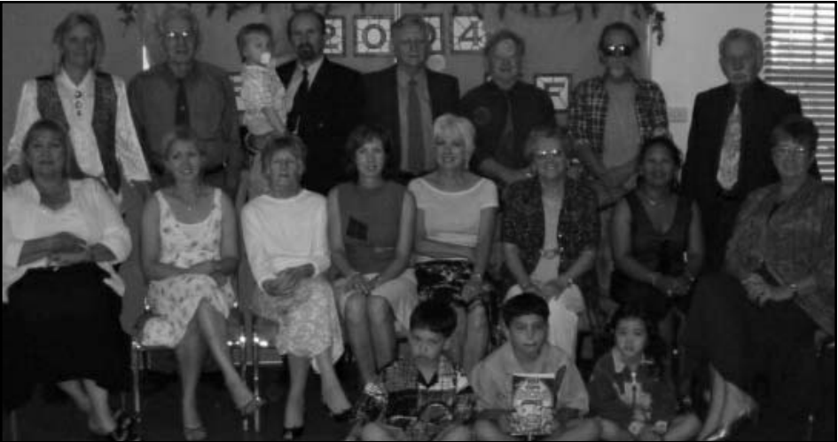
Brethren get together for a group picture at the Ballina feast site.