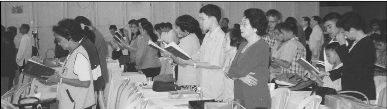
Festival services were held at the Development Academy of the Philippines (DAP), Tagaytay City.