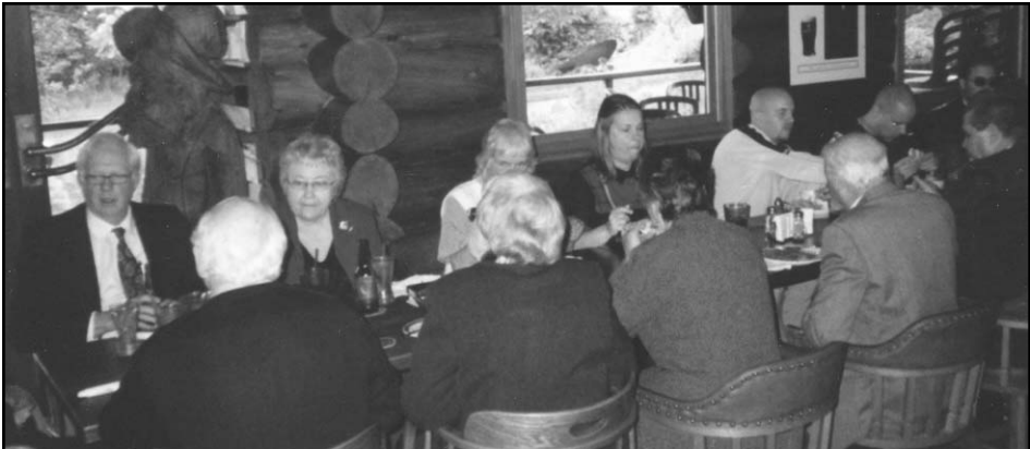
Above: Lunch at “The Pub” (Harrison Hot Springs)

If you are like I was, then you either a) have not read the accompanying article (though you absolutely should !), or you’ve used the following short-sighted excuses as to why you’ve never seriously considered Niagara Falls, Canada as your next feast site: “ It’s almost twelve hours away. ” “ It’ll be freezing cold. ” “ It’s not worth the trip. ” “ Borders, and customs—I don’t need to deal with those hassles. ” My response: Wrong, wrong, wrong, and wrong. If you are driving from a mid-southern state such as Tennessee, Niagara Falls is just an hour longer away than Pensacola—but with highway all the way. The weather is perfect—in 2004, it ranged from 55F-82F. Not worth the trip? You couldn’t me more wrong. Read the accompanying article to learn about one of the church’s best-kept secrets! (And those “customs and borders” are a breeze.)