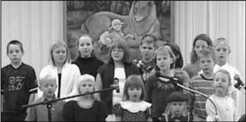
Above: The Children's Choir provides special music at Western Hills Guest Ranch.