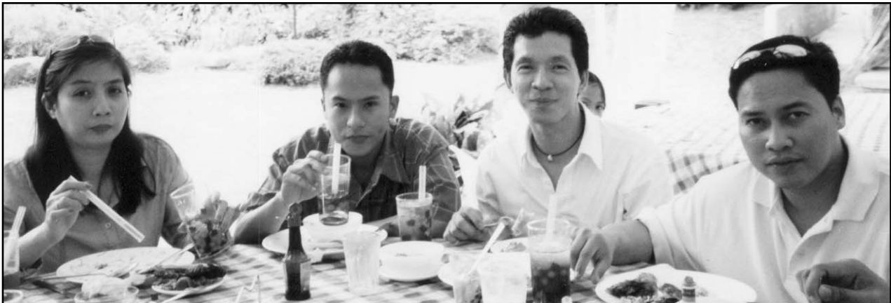
Right: Brethren enjoying the sumptuous lunch at Josephine’s.