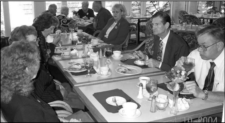
Above: Brethren enjoy good food and fellowship at the senior citizens luncheon at Myrtle Beach.