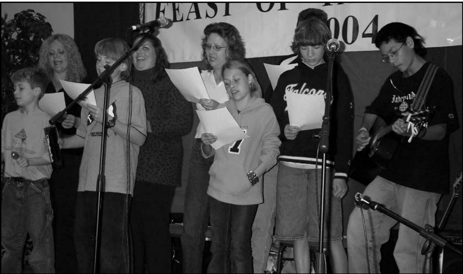
Below: A scene from the 2004 Talent Show at the Myrtle Beach site.