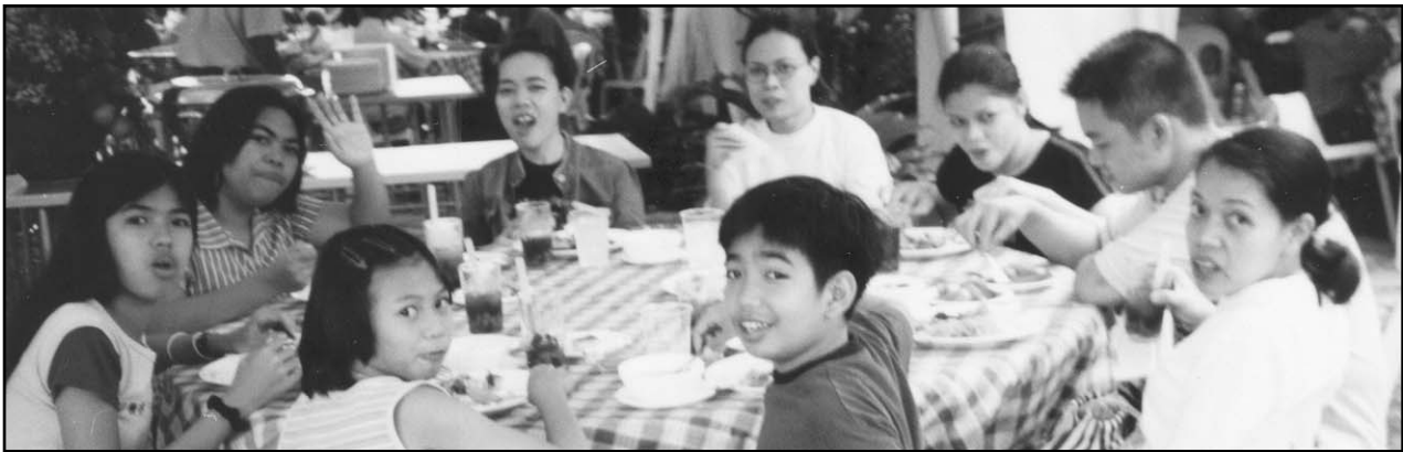
Above, right: Lunch at Josephine’s Restaurant in Tagaytay.