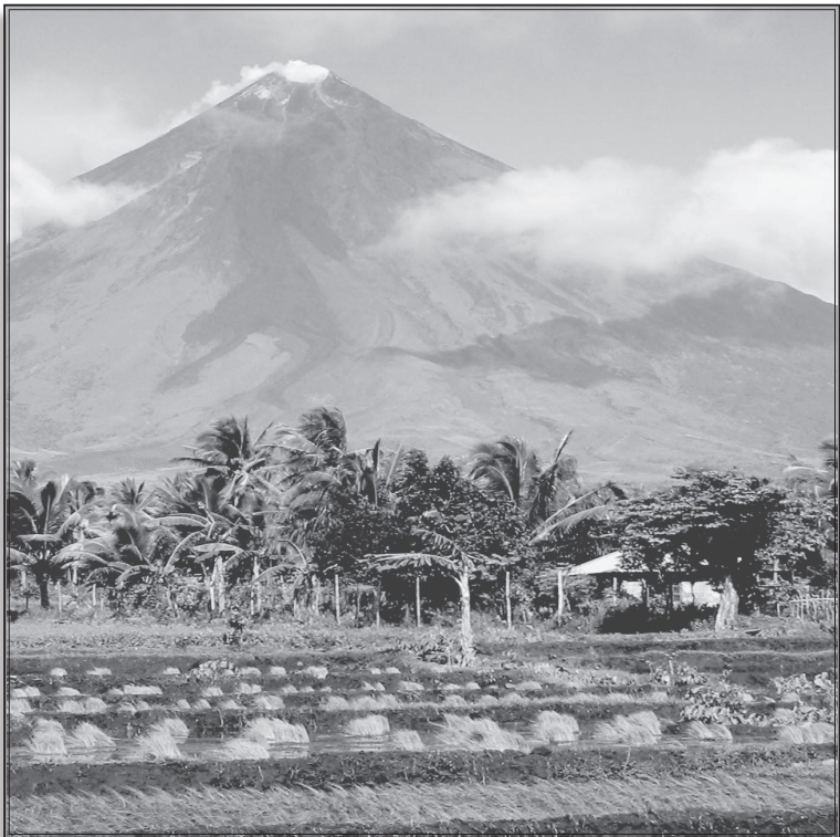
Mt. Mayon, Philippines

There are other hotels and housing facilities available in the area, as it is a popular tourist spot overlooking Taal Volcano, a small volcano within a larger extinct volcano. But there is no need to worry over volcanic activity, as Taal has been dormant for a very long time.