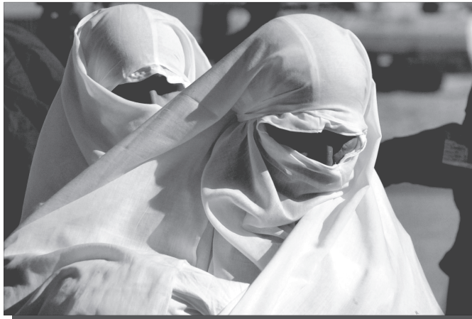
Islamic women: Islam is currently the worlds fastest growing religion.