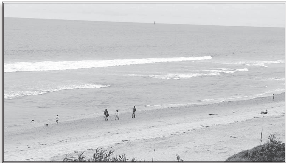
Group Rates for Springmaid Resort:

Many activities are planned for all at Myrtle Beach this year, so prepare to enjoy eight days of fellowship, uplifting sermons, inspiring music, and spiritual revitalization at God’s Feast of Tabernacles 2006 in Myrtle Beach, South Carolina.