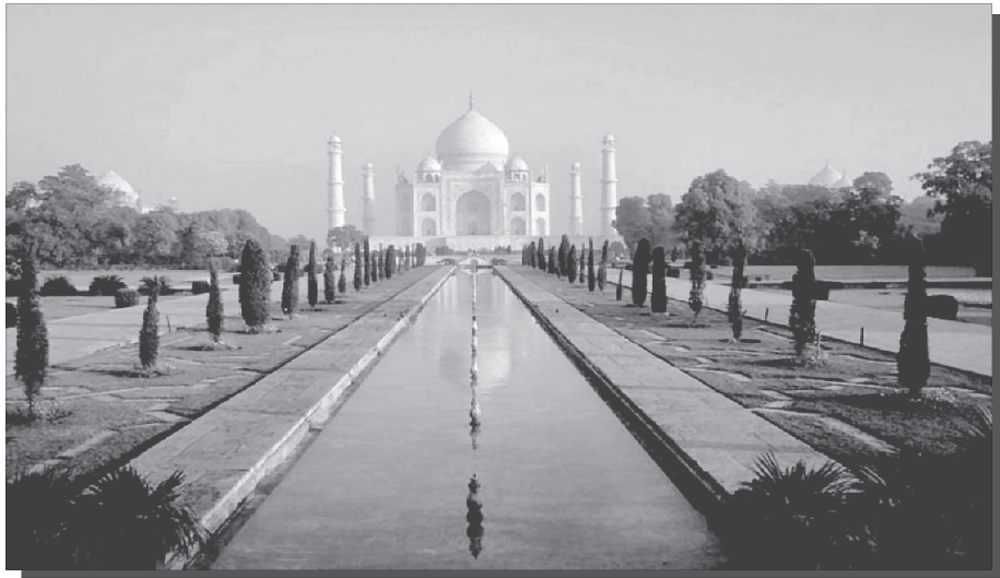
India's Taj Mahal: a symbol of growing prosperity

fied that these things happen at the “time of the end” (Daniel 12:9). Additionally, with a temple built and the daily sacrifices stopped, conditions conducive for “the abomination that makes desolate” can be set up (Daniel 12:11; Matthew 24:15; Mark13:14). Remember, at some point even the Apostle Paul recognized that a man would come along “Who opposeth and exalteth himself above all that is called God, or that is worshipped; so that he as God sitteth in the temple of God, shewing himself that he is God” (1 Thessalonians 2:4).