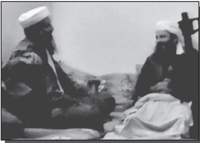
Osama Bin Laden: Terrorism has become the new menace of the global community.

However, all of these items are factors contributing to the massive trends catapulting the world toward a “ new world order ” that will position three major powers to face off with each other in the latter days: the King of the North, the King of the South, and those powers to the northeast of Jerusalem (Daniel 11:40–45). Sadly, it is obvious the influence and military might of the United States and Britain will have been previously neutralized, eliminating them from any involvement as a nation during these latter day conflicts .