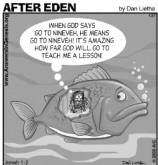
A school of one fish.

Have you every doubted there is a God? Have you wished for a miracle to help you truly believe in God? The answer Jesus gave the Pharisees is the perfect answer for each of us today. We don't need more miracles or further evidence because we have Jesus' death, resurrection and through that came the promise of salvation.