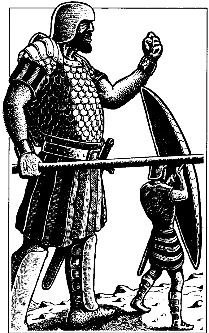
In the name of his gods, Goliath shouted curses and threatened to feed David's dead body to the birds and beasts.

his hours of practicing the sling, along with his trust in God, was about to make history.