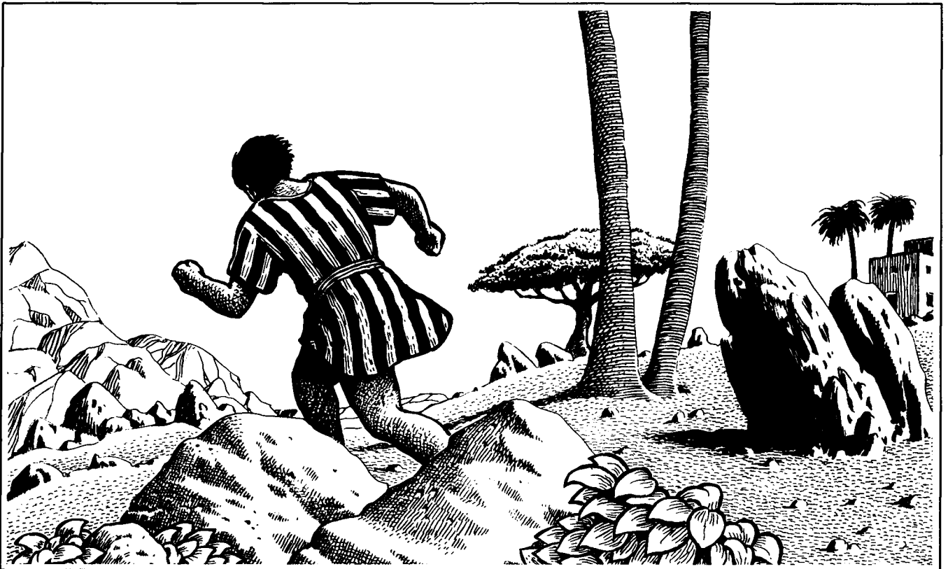
Jonathan's young servant ran to get the arrow that Jonathan had shot past David.

Saul was enraged to learn that one of the priests had helped David. In his anger, the king ordered the priests and their families killed (verses 18-19).