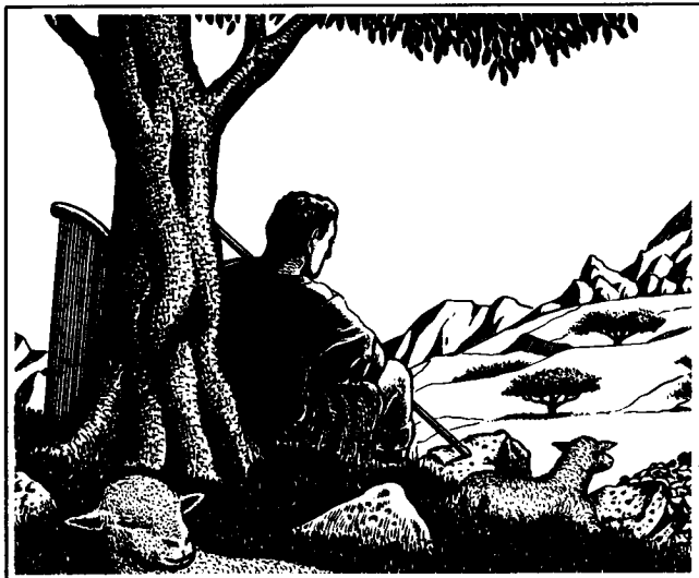
David returned from the king's palace to continue caring for his father's sheep.