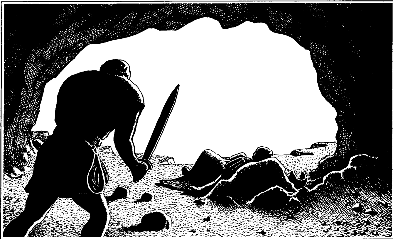
David quietly crept from the back of the cave to cut a piece of cloth from Saul's robe.

We can see from Saul's example how dangerous anger and jealousy can be. It is important that we all learn to control our tempers and emotions. Many people have been hurt or killed because of jealousy and hatred. We should try to follow David's example, and not the example of King Saul.