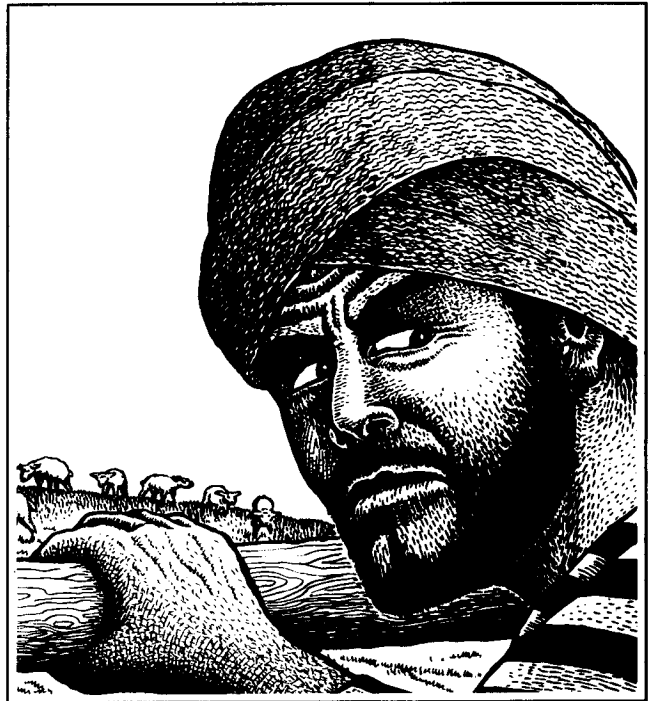
Nabal only scowled and continued shearing his sheep as David's men rode up.

One day, when David and his men were tired and hungry, David sent a group to a sheep rancher named Nabal. Nabal was a very foolish man. The name Nabal means "fool." But somehow, Nabal had managed to