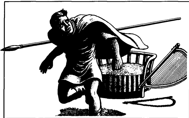
While David played the harp, Saul suddenly hurled his spear at David.

Saul thought he would have a spy in David's home.