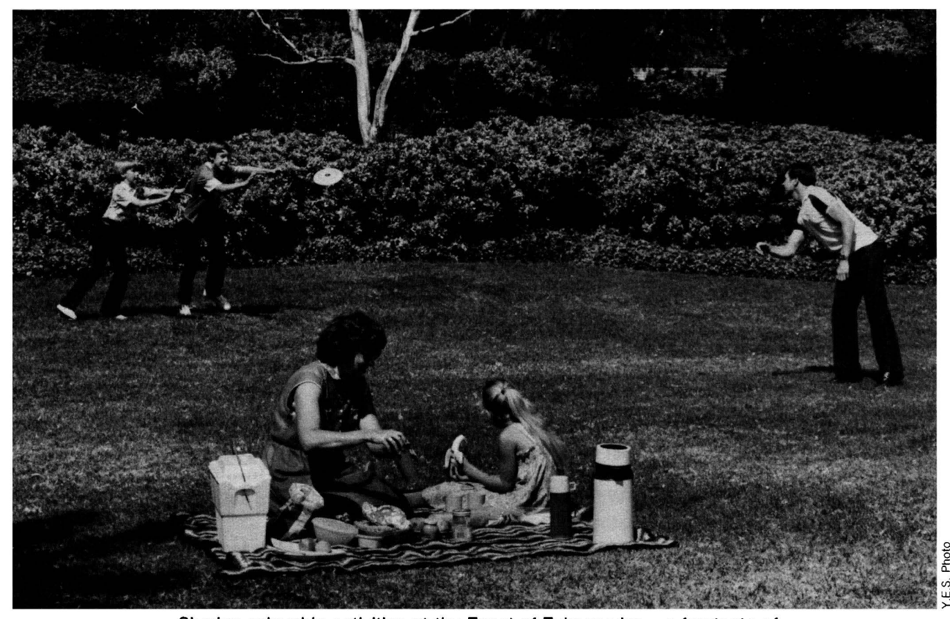
Sharing enjoyable activities at the Feast of Tabernacles—a foretaste of universal peace, joy and cooperation in the World Tomorrow.

"knowing that shortly I must put off this my tabernacle, even as the Lord Jesus Christ hath shewed me" (II Pet. 1:14).