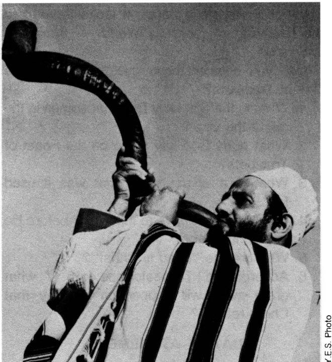
The shofar alerted ancient Israelites to various things such as approaching armies. A mighty trumpet blast will announce Jesus Christ's return.

The Bible says that Christ will return with the sound of a trumpet. Read it in I Thessalonians 4:16. Isn't it a shame that Satan has so deceived the world that Christ's wonderful reign of peace will have to begin with war?