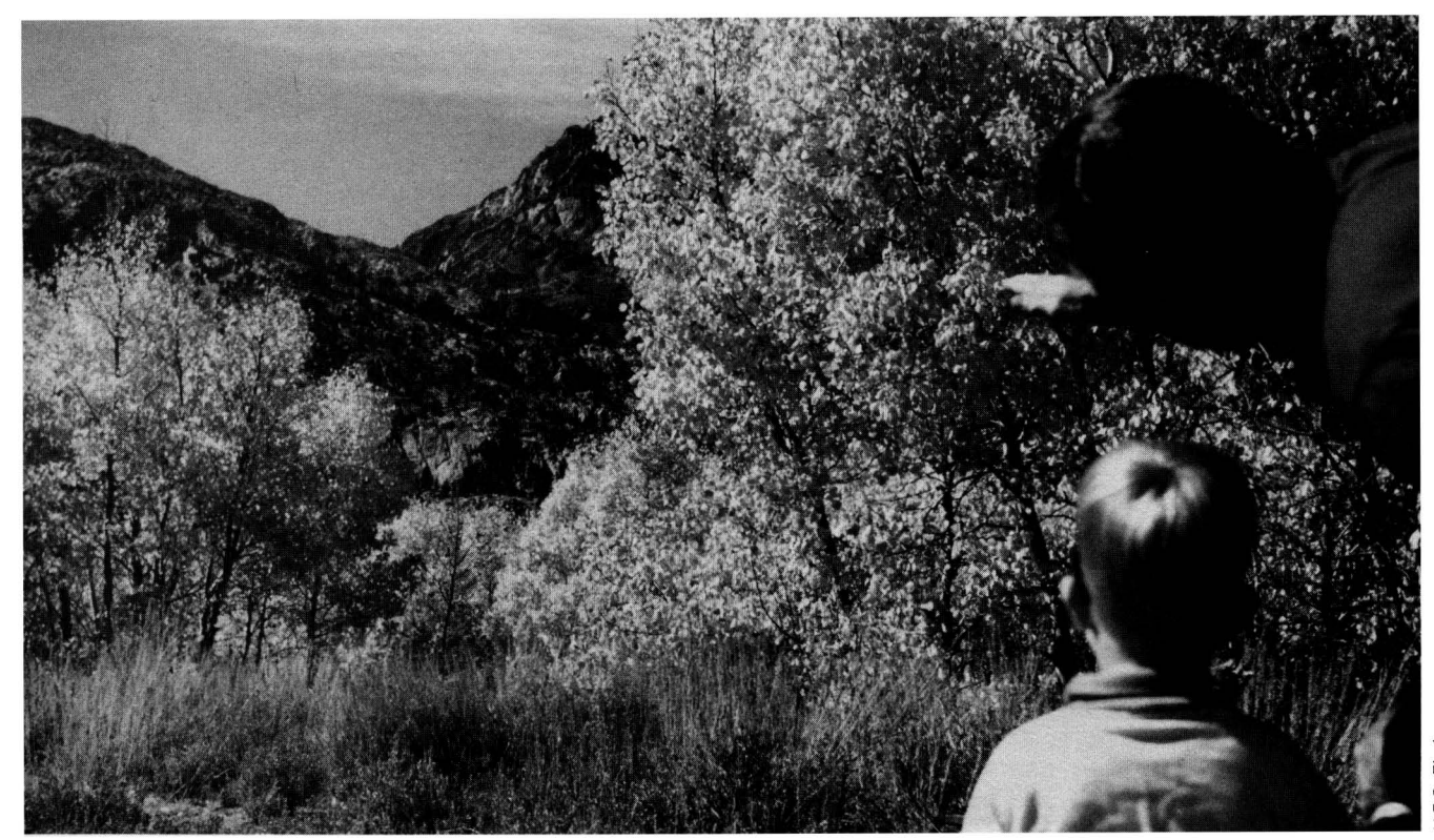
Families are able to spend time together at the Feast of Tabernacles and enjoy the wonders of creation.

The Feast of Tabernacles was celebrated just after the larger fall harvest. Ancient Israel was a farming society, and the successful harvest was