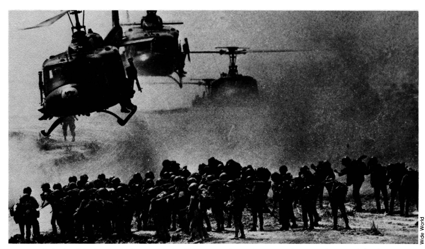
Satan's attitude of rebellion and hatred has caused man to pursue the way of war and death.

Some time after Satan was given power over