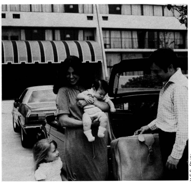
Living in temporary dwellings at the Feast shows us that our physical lives are just temporary.

always a time of great rejoicing. With the corn and the olives and the grapes all gathered in, the family could now depart for their annual journey to Jerusalem to keep the Feast.